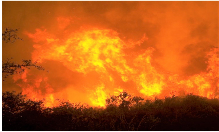
Flames from a wildfire burn in Napa, California, on Monday, October 9, 2017.